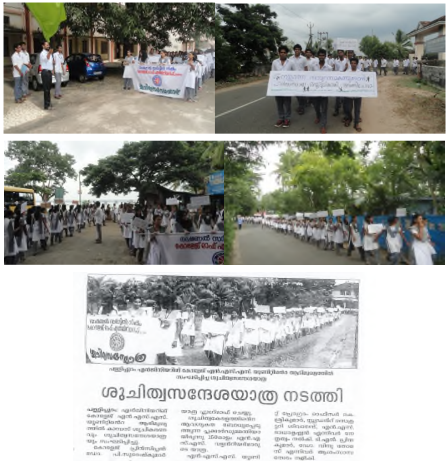
Photos 8. Suchithwa Sandesa Rally