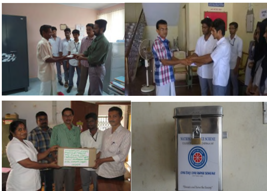
Photos 13. Helping hand by the NSS