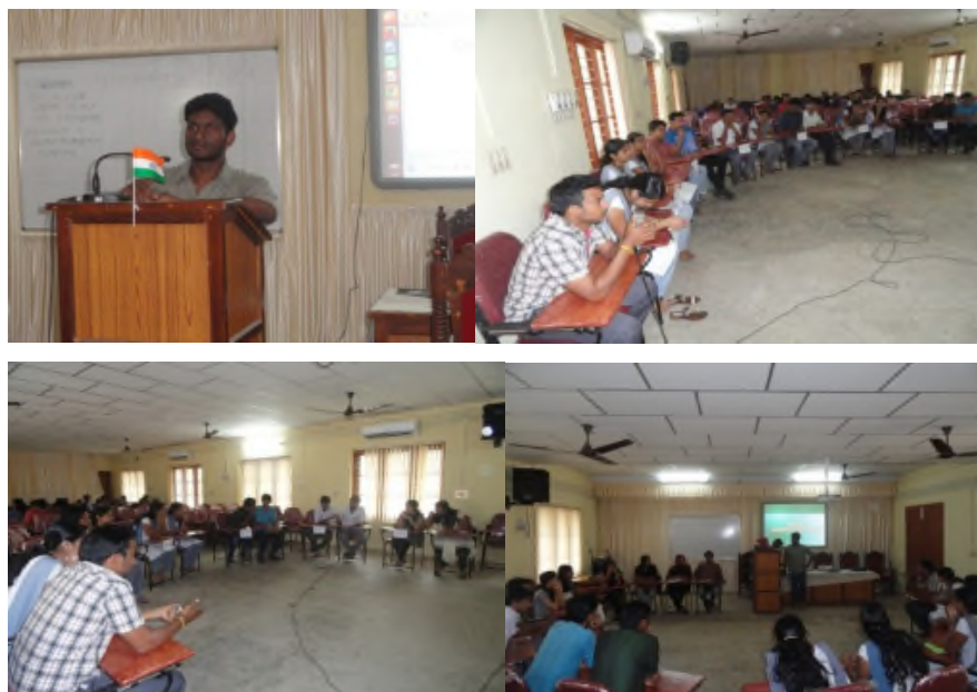
Photos 2. Independence Day Celebration