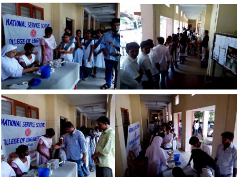
Photos 6. Blood Group Identification Camp