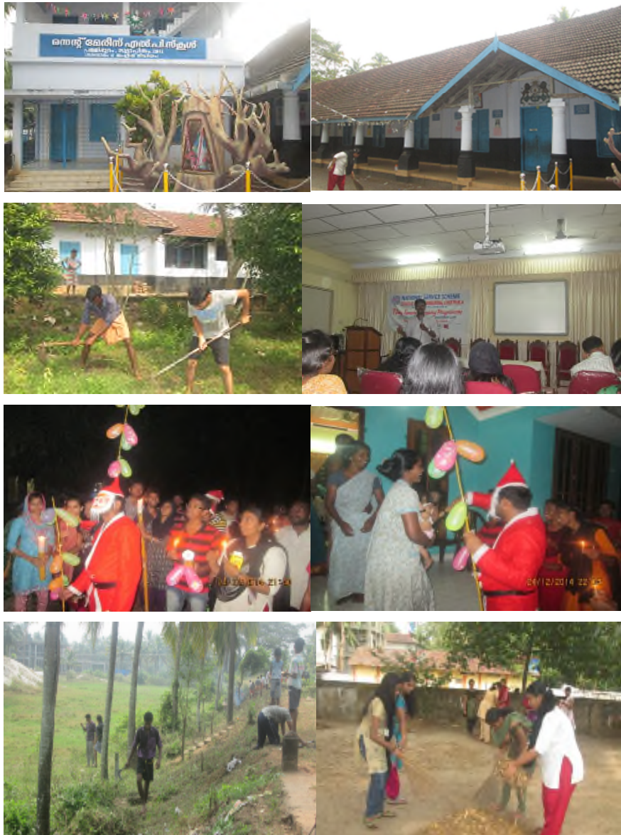
Photos 12. Annual Special Camp