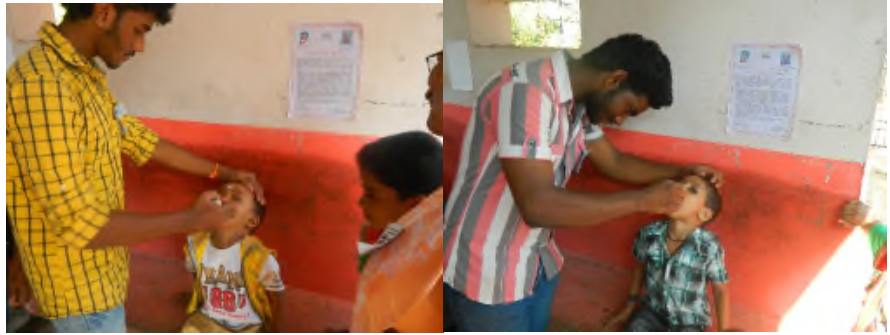
Photos 15. NSS Volunteers distributing Polio Vaccine.