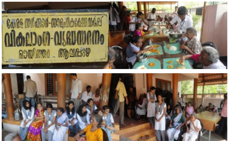
Photos 5. Visit to Oldage Home at Mayithara, Cherthala.

A team of 25 NSS Volunteers visited the Old Age Home at Mayithara, Cherthala which is under Social Welfare Department of Govt. of Kerala, on 26 th September 2014. The NSS volunteers served lunch for the inmates of the old age home. The Volunteers conducted a few entertainment programs such as singing, mimicry etc for the relief of the inmates. The visiting was under the supervision of the NSS program officer and a lady staff from the college.