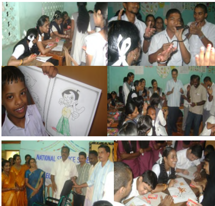
Photos 9. Visit to Ardra Special School