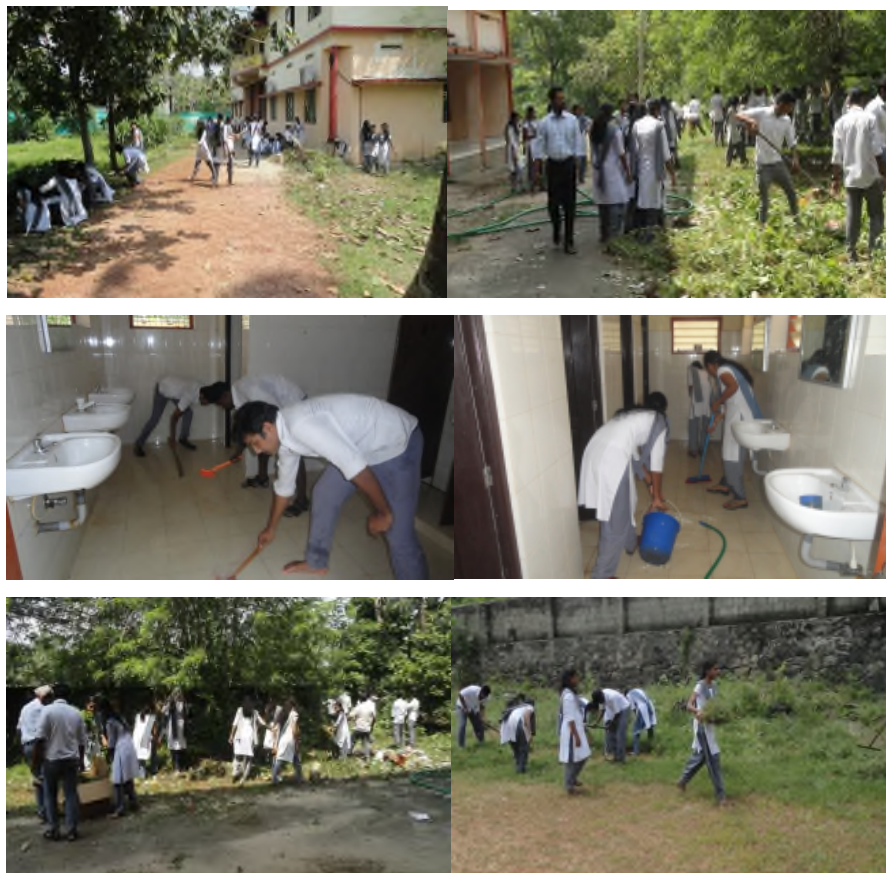
Photos 7. Cleaning the Campus and toilets