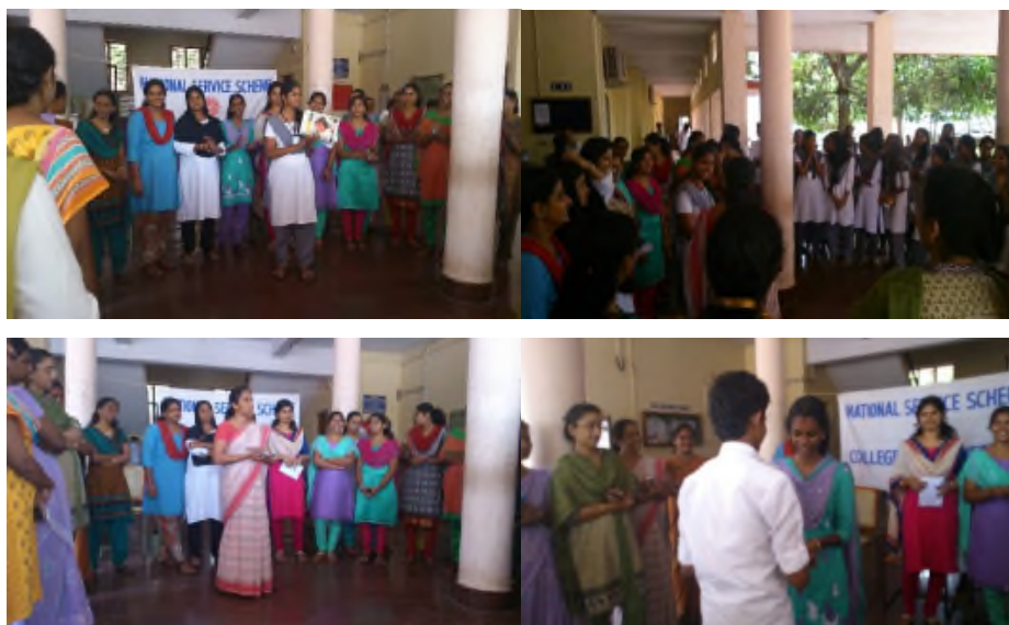
Photos 10. Women's Day Celebration