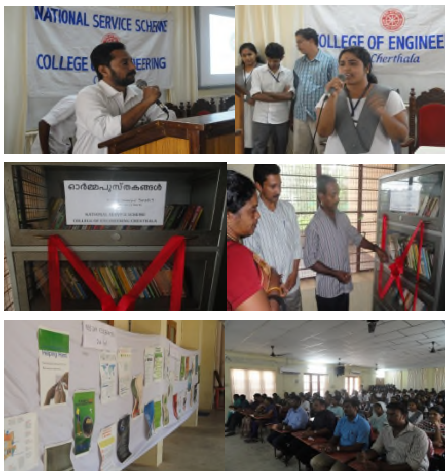
Photos 3. NSS Day Celebration-Ormapusthakangal Inauguration and Poster Exhibition

A poster exhibition was also conducted on the NSS day. The theme of the poster presentation was "Energy conservation, E-waste and Green earth".