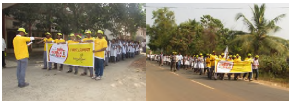
Photos 14. Participation in Run Kerala Run event

Four of the NSS Volunteers attended the Polio Vaccine distribution program, which is the program conducted nationally under the Ministry of Health supervision every year in January and February.