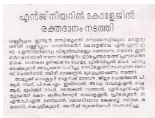
Photos 11. Blood Donation Camp