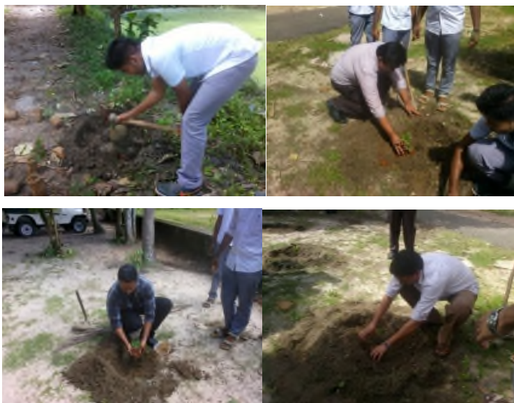
Photos 1. Planting Saplings